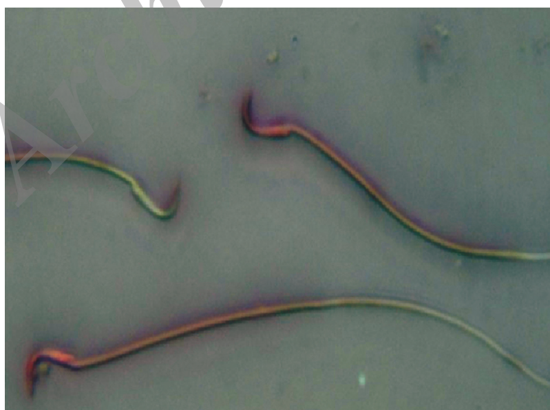
Fig.1: Sperm with altered plasma membranes appeared pink whereas those with intact plasma membranes did not stain (EN ×400).

Data are presented as mean ± SEM. Values with different letters indicate significant differences among groups at p \leq 0.05 .